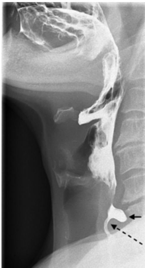
Fig. 2. Barium swallow demonstrating incipient diverticulum (solid arrow) with cricopharyngeal hypertrophy (dashed arrow).

oropharyngeal dysphagia secondary to CPH, including balloon dilatation [21, 22], myotomy [21, 22], botulinum toxin [22, 23], and flexible endoscopic septum division (FESD) in the context of ZD [24]. Hence, barium assessment of patients with oropharyngeal dysphagia and IF is necessary to facilitate treatment and reduce dysphagia-related morbidity.