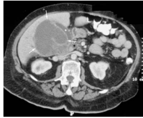
Fig 2. Computed tomography: a thickened and enhancing wall of the enlarged gallbladder (arrows), a dilated CBD (black asterisk) and pericholecystic fluid collection (white asterisk).

gallbladder with persistent contrast uptake of the thickened wall compatible with ongoing inflammation but no clear-cut evidence for malignancy. In anticipation of surgical problems due to adhesions and obscured anatomy, the patient was subjected to an uncomplicated open cholecystectomy with intraoperative frozen-section examination. This and the final pathologic evaluation established the diagnosis of xanthogranulomatous cholecystitis (XGC), accounting for the multiple complicated course including liver involvement with incipient abscess formation, extensive choledocholithiasis causing ascending cholangitis, and incomplete Mirizzi syndrome.