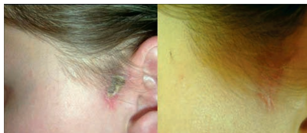
Fig 1. Metastatic CD affecting the preauricular region before and after infliximab therapy

the diagnosis of metastatic CD. Because of the simultaneous refractory perianal fistula, biological therapy was initiated after Seton placement. Infliximab induction therapy resulted in a rapid remission of the preauricular lesion (Fig. 1) and the discharge of the perianal fistula also significantly decreased.