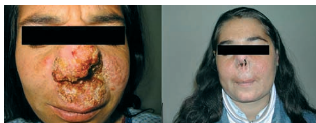
Fig 2. Metastatic CD affecting the nasal region before and after infliximab therapy.

A 23-year-old female was admitted to the Dermatology Department with a destructing and exuding nasal scar in March 2003. The histology evaluation of the cutaneous biopsy suggested CD as a background systemic disease. Gastrointestinal examinations did not confirm the diagnosis of CD. However, the histology revision of previous surgical samples performed because of multiple enterocutaneous fistulas revealed CD-specific granulomas. After one year of ineffective treatment with antibiotics and corticosteroids, infliximab was initiated. Six weeks after the second infusion the scar became significantly smaller and the discharge from the nasal lesion ceased. With the use of combined infliximab and azathioprine maintenance therapy, further skin improvement was observed during the follow-up (Fig. 2).