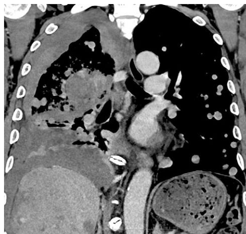
Fig. 1. Contrast-enhanced computed tomography showing a metastatic tumor rupture in the right lung.

Lenvatinib is an inhibitor of multiple receptor tyrosine kinases and is widely used as the first-line treatment for unresectable HCC. Hepatocellular carcinoma rupture related to lenvatinib treatment appears to be extremely rare [1], and