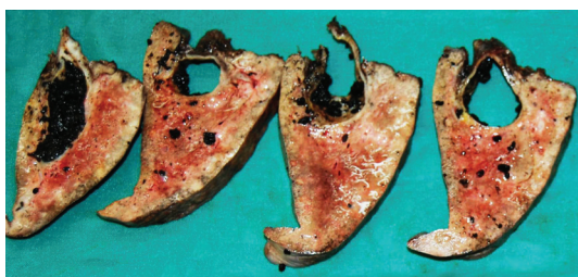
Fig 2. Sectioned left hepatic lobe - dilated bile ducts and lithiasis.